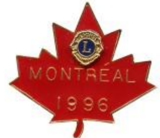
1996 Origin Unknown