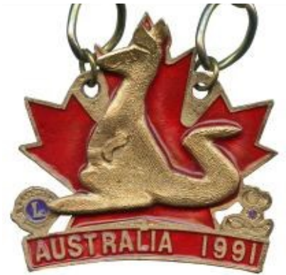
1991 Special Medallion