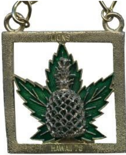
1976 Origin Unknown